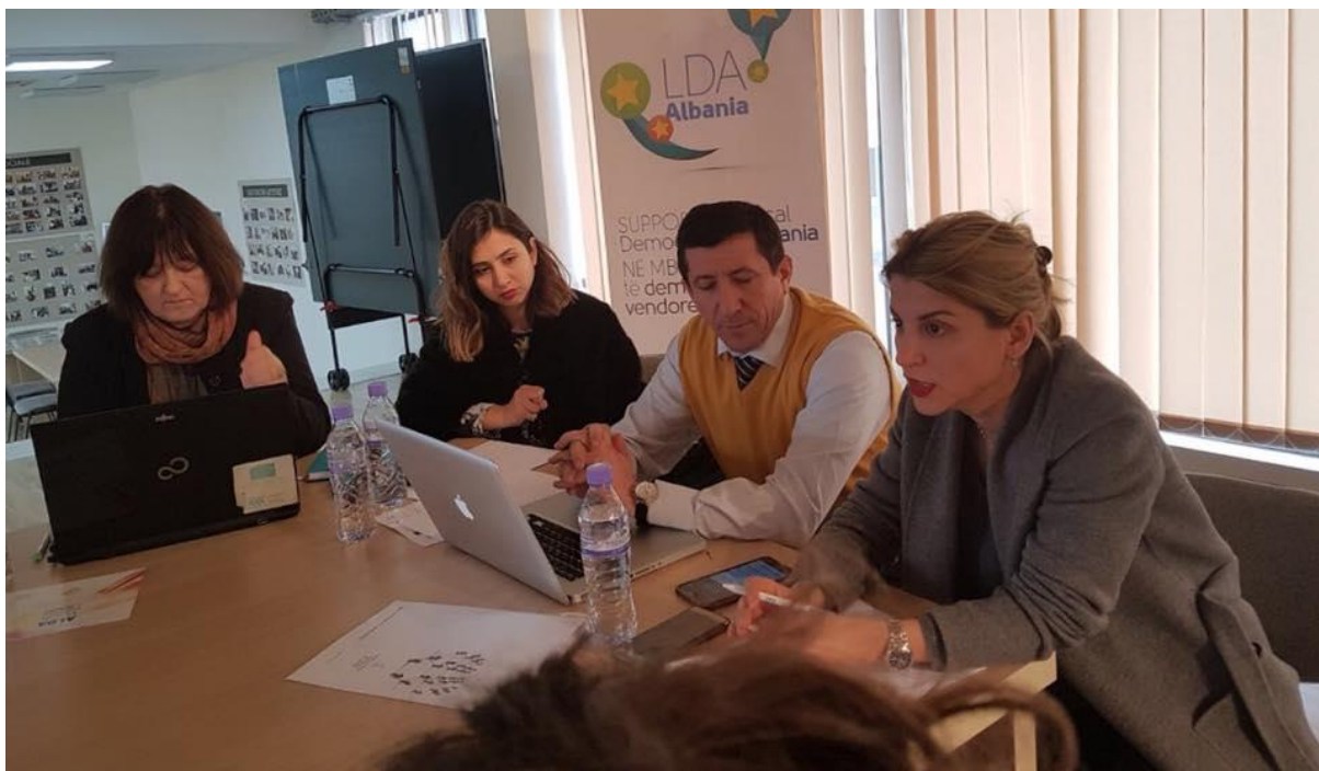
Seminar: Local Stakeholders Involvement in Migrants' Inclusion, Vlora, Albania, 9th March 2018