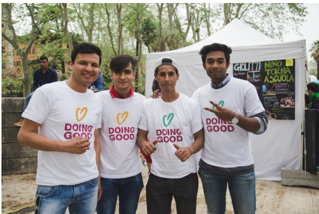
Good Deeds Day 2018, Rome, Italy, 15 th April 2018

The intercultural laboratories targeted a group of 240 children from kindergarten and primary school classes, as well as their teachers and family members. The laboratories offered activities such as; theatre and African dance workshops, children's choir of Piazza Vittorio, innovative art workshops on the English-Chinese language and a one-day public event called Good Deeds Day 2018