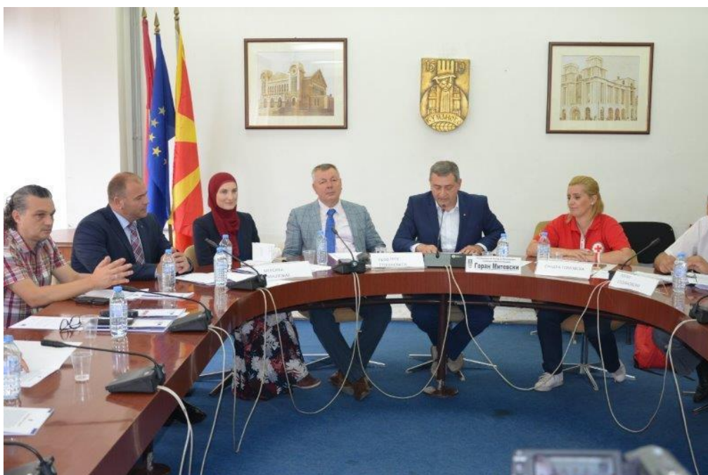
Conference on decreasing stigmatisation in times of migrant crisis, Kumanovo, Macedonia, 26 th June 2018

Members of the public showed great interest in it the conference. All of the key speakers gave a very exhaustive and descriptive presentations, representing both their institutions as well as their own point-of-view. Covering multiple facets of the administrative structure, the key speakers were from the governmental sector (Director of the Centre for Crisis Management), the local government sector (the Mayor of the Municipality), the international community (Professor at the Faculty for Security and current President of the “European Movement”), and the NGO sector (Head of border team of the Red Cross and Director of NGO “Legis”). The conference overall produced successful results, instigating the sense of reflecting on the current achievements, re-evaluation of the current approach, in addition to strengthening and furthering cooperation for future initiatives.