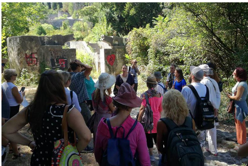
Cultural tour “Monuments in Motion”, Mostar, Bosnia & Herzegovina, 6 th September 2017