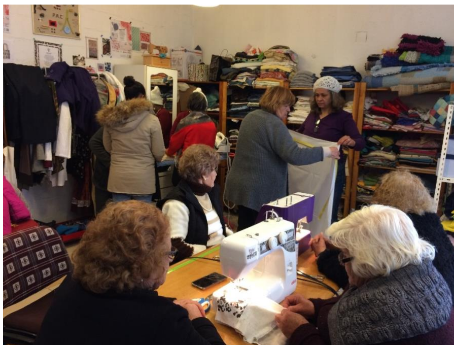
Building a Diversity Blanket, Lisbon, Portugal, 20 th – 26 th February

The results of the pilot projects are the following; the activities successfully provided an interaction between the different target groups as well as the integration of people from different cultures within the diverse community of the area. This in turn helped establish a relationship between the citizens from different cultures and nationalities and promoted a space for an intercultural dialogue. Moreover, the sports activities were used as a tool for the promotion of integration through non-verbal communication which provided inclusion for those who did not speak sufficient Portuguese. The projects overall also created a network of partners who share the same concerns in order to further produce collaborative projects.