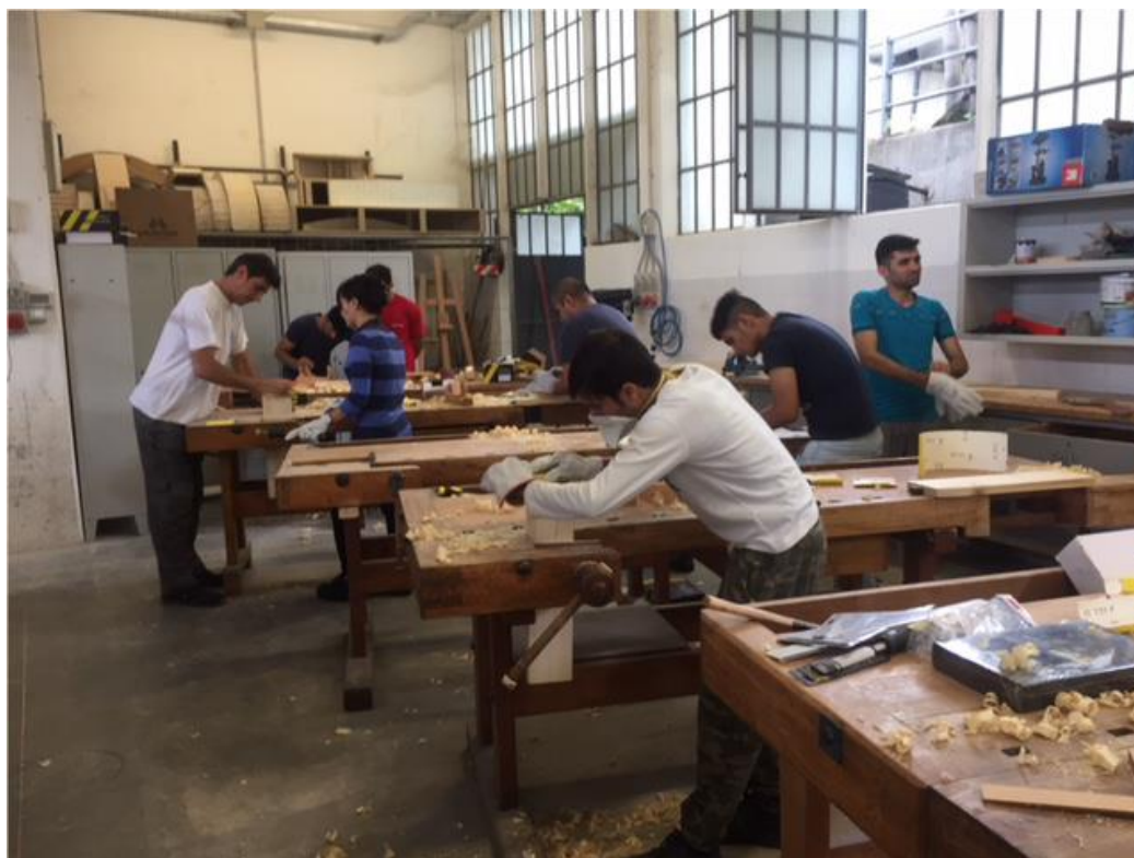
The "ROHBALab Not just a woodworking workshop", Trieste, Italy, 15 th June 2017 – 14 th September 2017