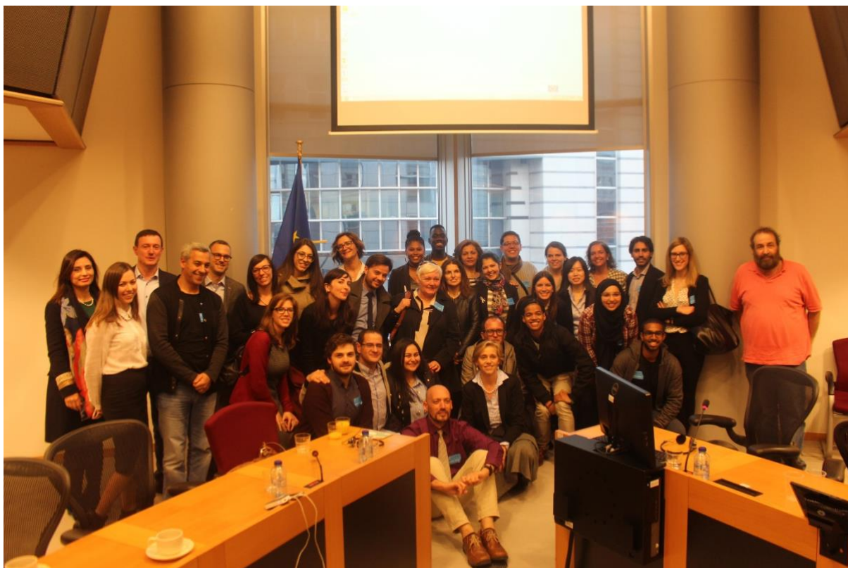
Seminar “Employment, Culture, Participation: re-shape European cities and communities for the effective inclusion of migrants”, Brussels, Belgium, 22 nd March 2017