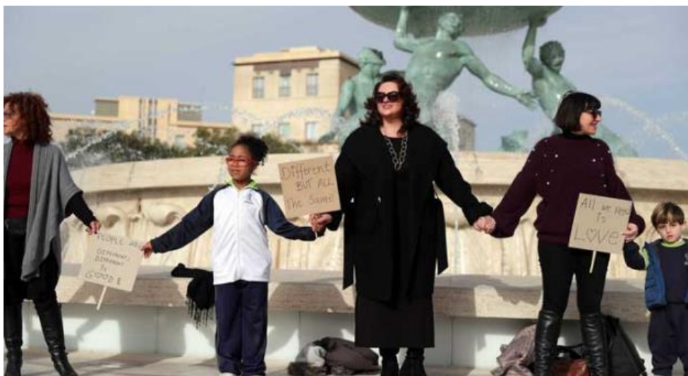
The Human Chain for Diversity, Valletta, Malta, 21 st March 2018

The event also gained a lot of media attention. It was covered by national news stations and national papers which highlighted the positive elements of diversity and generated further visibility for the project. In parallel to the event, many schools around the Maltese island who could not be physically present in Valletta supported SOS Malta in their celebration of diversity within their respective school. In order to do so, the project organisers provided them with a 'classroom activity guide' as a way to start a discussion on diversity and understanding with the students.