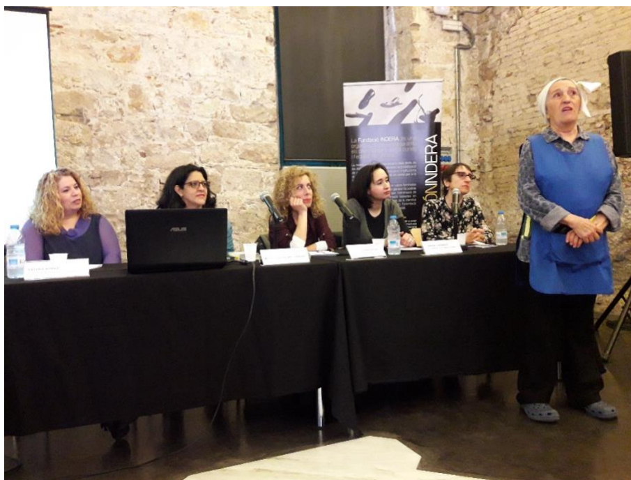
Seminar on “Migrant women as builders of social cohesion: bodies, relations and jobs”, Barcelona, Spain, 12 th March 2018