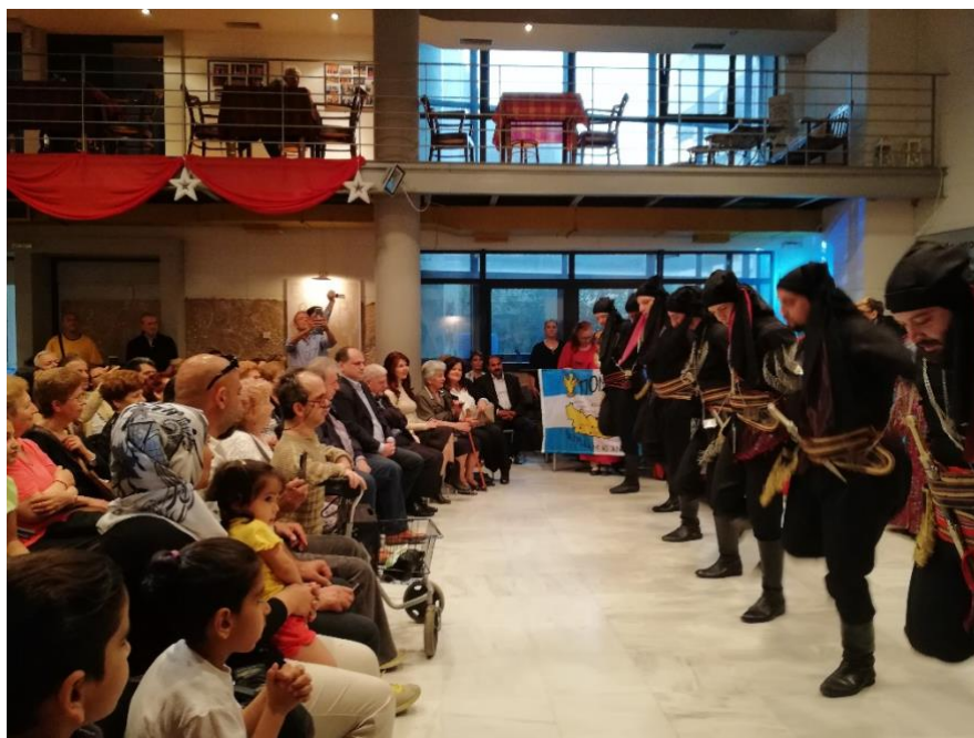
Town Against Discrimination Event, Aghia Varvara, Greece, 6 May 2018